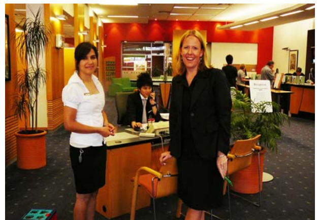
Madina Ayubi National Bank