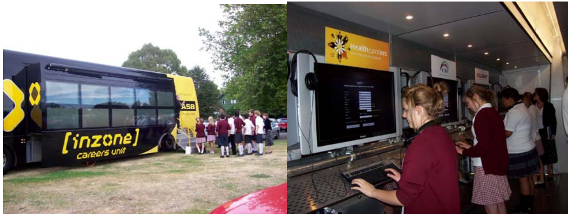
Term 1 – Year 10 students visit to the Inzone Careers Bus